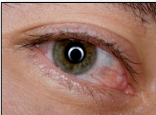
There Is Help For Dry Eye Syndrome

I have long been impressed with the role the oil-producing meibomian glands play in maintaining good vision and preventing dry eye. Many patients have asked why no one has ever encouraged eyelid hygiene and warm compresses to keep these 60 or so (30 in each lid) oil glands on the eyelid margins open and flowing. I can only speak for myself, but those with dry eyes do much better when we work on softening the oils in these plugged glands. The oil should be like cooking oil, but frequently, as a result of heredity and birthdays, it becomes more like " Crisco. "