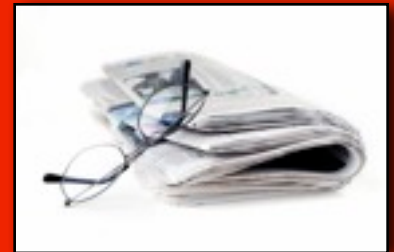
Difficulty Reading Small Print