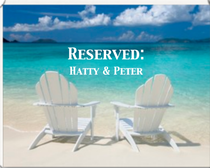
The 2009 Prize is Gone...Stay Tuned for 2010’s ‘Dare To Share’ Details in Next Month’s Issue!