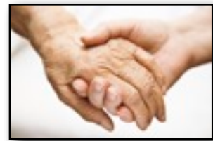
HELPWANTED! Pg 2