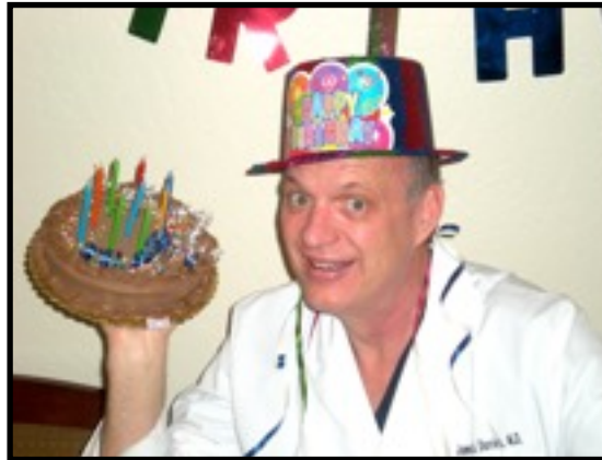
57 Candles Didn't Fit!

It seems like just a few years ago that January brought my first new day--in my first new year. Now, as of Saturday, it's been 57 years. That's not that old, is it? Just as my arrival brought a lot of changes to my family, the dawning of this new year has brought more changes for you and our practice.