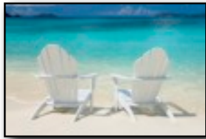
She's Off To Mexico...Pg 3