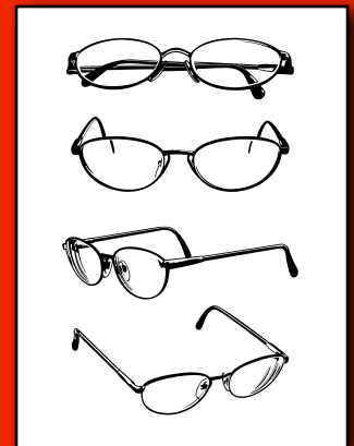
Frequent Changes In Eyeglass Prescription