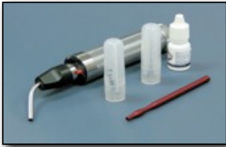
Meibomian Gland Probe