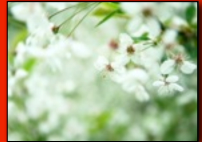
Cloudy Or Blurry Vision